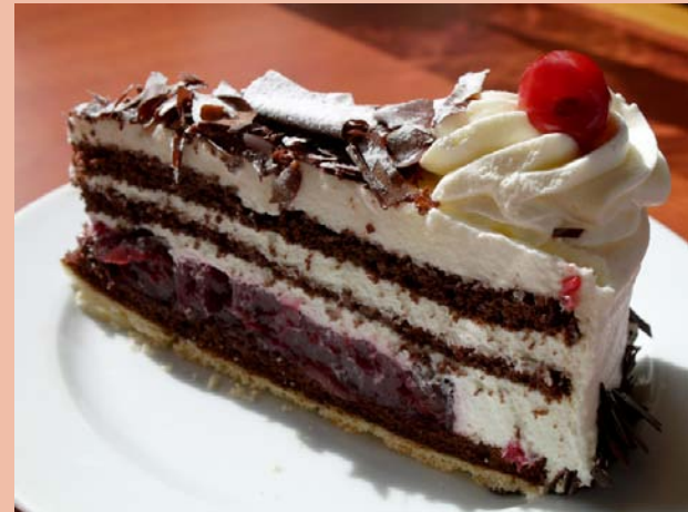
Piece of Cake!!